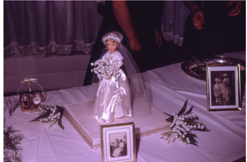
Doll is dressed in a re-creation of Laura's wedding gown